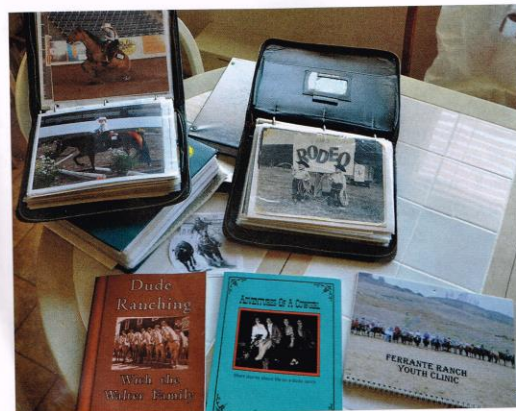
Photo albums and books showcase the family’s longtime history of excellence with horses.

HunterDouglas Rebates $50 to $100 per shade