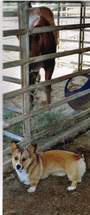
Horses, dogs and other animals have always been part of the Ferrante family.